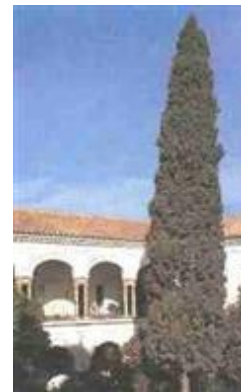
Monasterio de San Clemente, host for the final Congress dinner.