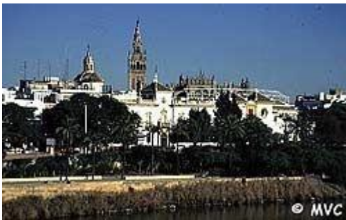
Seville, venue for the 2nd EALCJ Annual Congress on Fundamental Social Rights

The results of the Congress deliberations have been published by Ashgate Publishers in the form of the volume Fundamental Social Rights at Work in the European Community .